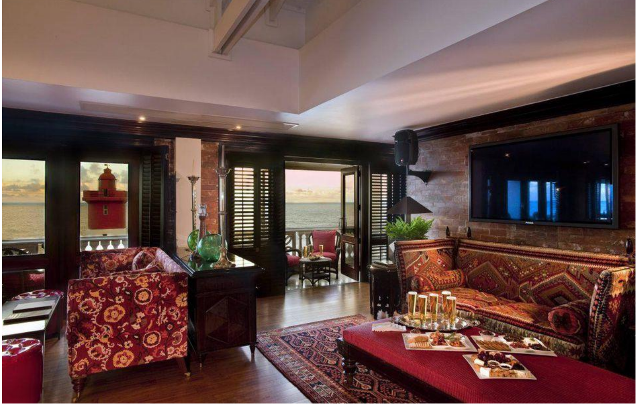
Lighthouse Bar at The Oyster Box - DURBAN TOURISM

THE OYSTER BOX Set on a divine stretch of beachfront in tony Umhlanga's beachfront, overlooking the Indian Ocean and a picture-perfect red-and-white lighthouse, The Oyster Box is the place to be and be seen in Durban—especially during Durban July, when it hosts the race's jockeys. The 86-room Durban institution, newly 65 years old, is the city's only Leading Hotels of the World property, and for good reason: a stay there is alone worth the trip to Durban. There's an award-winning Spa featuring a Turkish Hammam, gorgeous tropical grounds with a private path to the beach, three chic bars, a majestic old-time Clock Library, magnificent local art lining the walls and even a private cinema, screening movies all day. Four restaurants (including a Chef's Table) serve up stunning cuisine with an emphasis on local. The curry buffet at Ocean Terrace delivered one of the best curry experiences this curry fanatic has ever indulged in (oh for the prawn curry!); the Grill Room is nothing short of a slice of Durban history, once host to all of the city's socialites (if those walls could talk!); and the breakfast buffet featured everything from oyster mornay (a delectable concoction of steamed oysters, spinach and poached eggs) to Indian daal, locally harvested oysters and, you guessed it, more curry. Oysterboxhotel.com