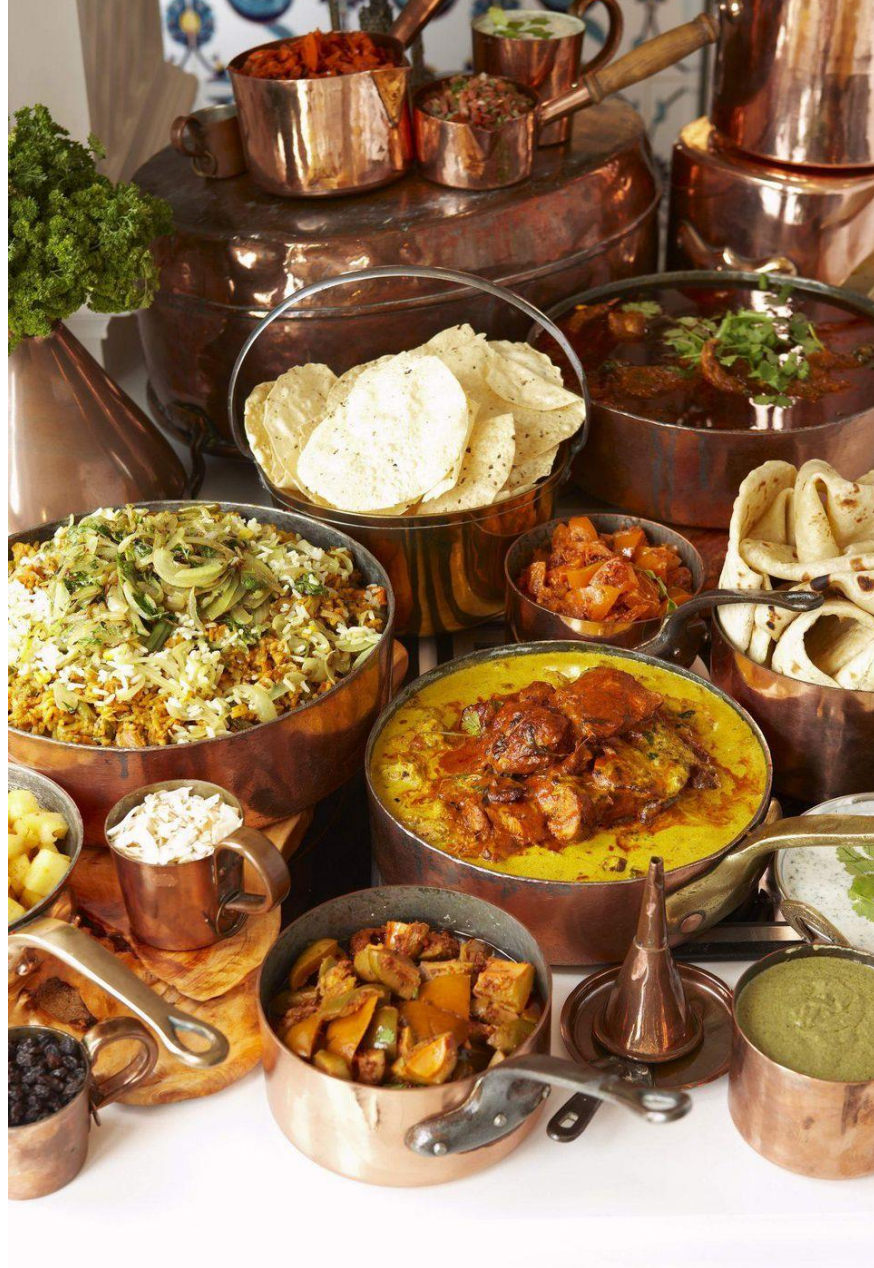
Curry buffet at The Oyster Box - DURBAN TOURISM

THE BUSH There are a number of stellar game reserves in easy driving distance from Durban, but you can also simply check into Ammazulu Palace and have a stay-in-the-bush experience just 25 minutes from town. On the edge of the Kloof Gorge, overlooking the Krantzkloof Nature Reserve—the views are spectacular, and you can hike every morning—the all-suite hotel feels like a fantastical dream, decked out in the incredible Zulu art collection of Durban artist Peter Amm. You can imagine you're Zulu royalty. Ammazulupalace.com