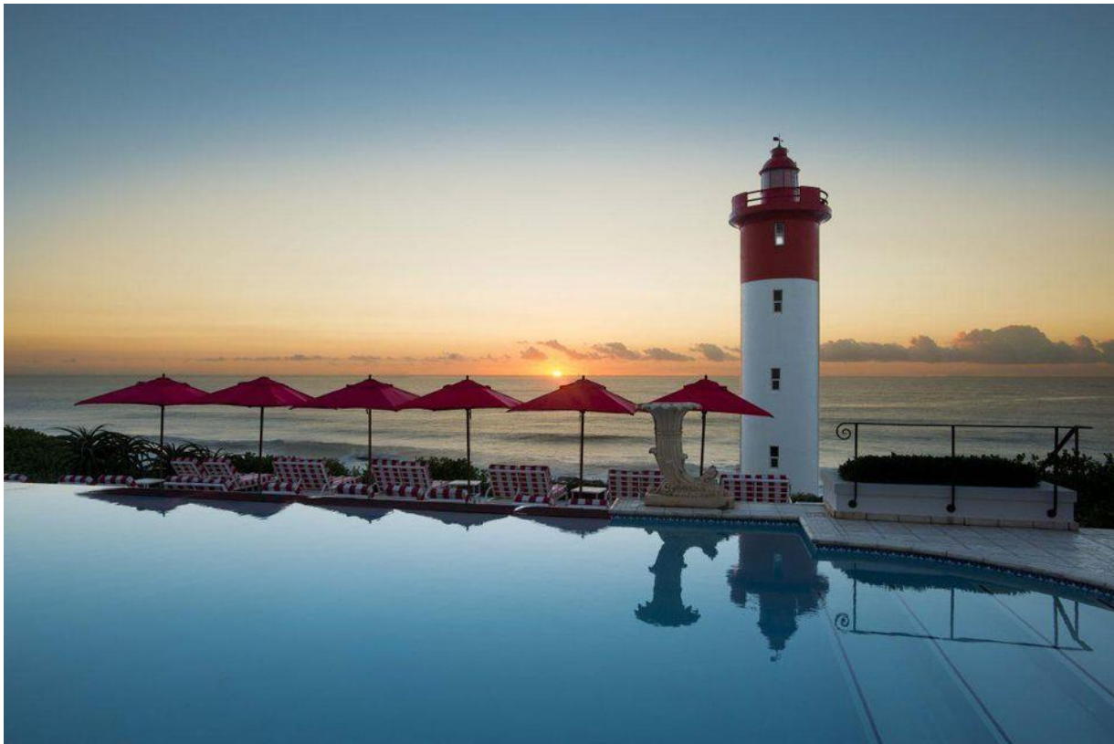
The Oyster Box hotel, Durban

Jul 22, 2018, 09:45pm 524 views #Wanderlust