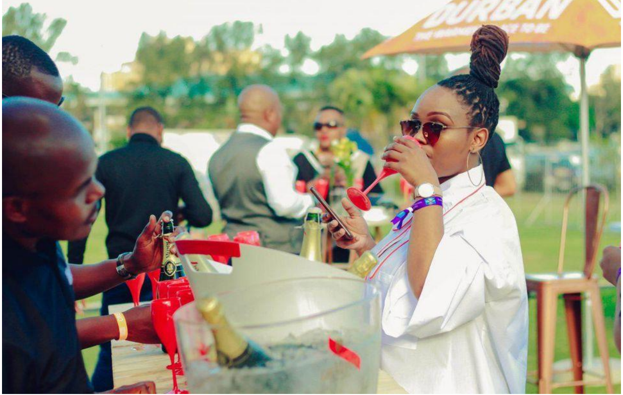
Vodacom Durban July

THE MARQUEES South African races are all about the marquees, where betting takes a backseat to fabulousity. Durban July's hottest tents, sponsored by such local companies as Vodacom (the race's main sponsor), Hendrick's gin and Durban Tourism, vie to outdo each other—and you'll enjoy every gluttonous, hedonistic moment of that competition. There's lavish food and drink, live entertainment, DJs, musical performances by South Africa's hottest acts and a party that lasts until midnight—when it's time for the afterparty. Sorry, afterparties .