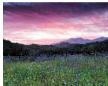
Book a staycation at Ojai Valley Inn to explore Ojai Valley Land Conservancy trails through nearby scenic landscapes like the Ventura River Preserve.

Barbara resort, known for its spectacular coastline views, offers private fitness and meditation sessions as well as picnic menus to enjoy on private terraces with choices like fresh fruit and cheese, grain bowls, and local wines. End the day with an alfresco movie screening, complete with truffle popcorn. ♦