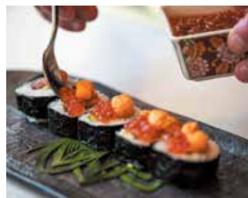
Get your sushi fix at Four Seasons Hotel Westlake Village's Onyx restaurant.

Belmond El Encanto has combined some of its rooms and suites with connecting doors to create six private cottages ( belmond.com/elencanto ; from $1,575) ranging from one to four bedrooms that accommodate up to 10 guests. The Santa